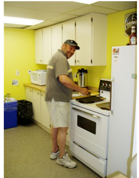
Vice Commodore Dirk Cookin' Racer's Breakfast