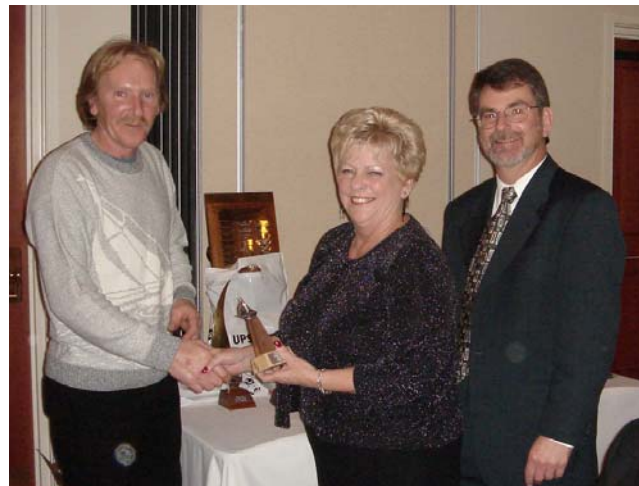
Hey - We're winners!