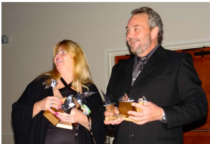
Taking Home the Loot!