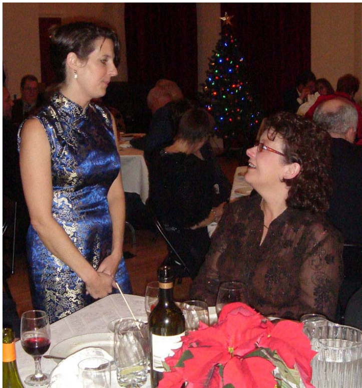
Evening of Glamour